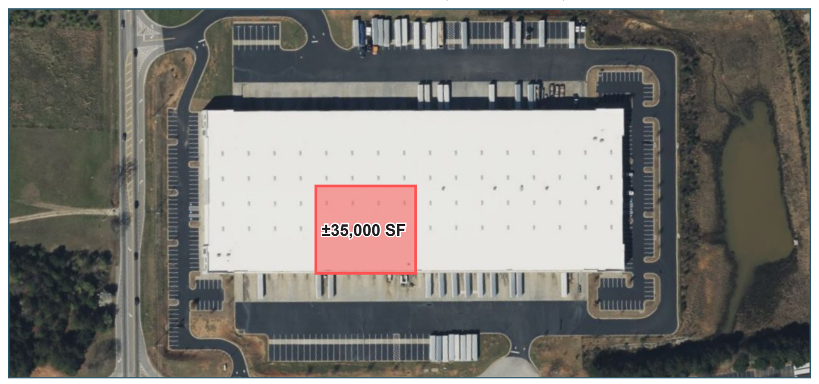
All information contained herein is believed to be accurate but is not warranted. This offer is subject to errors, omissions, prior sale or withdrawal