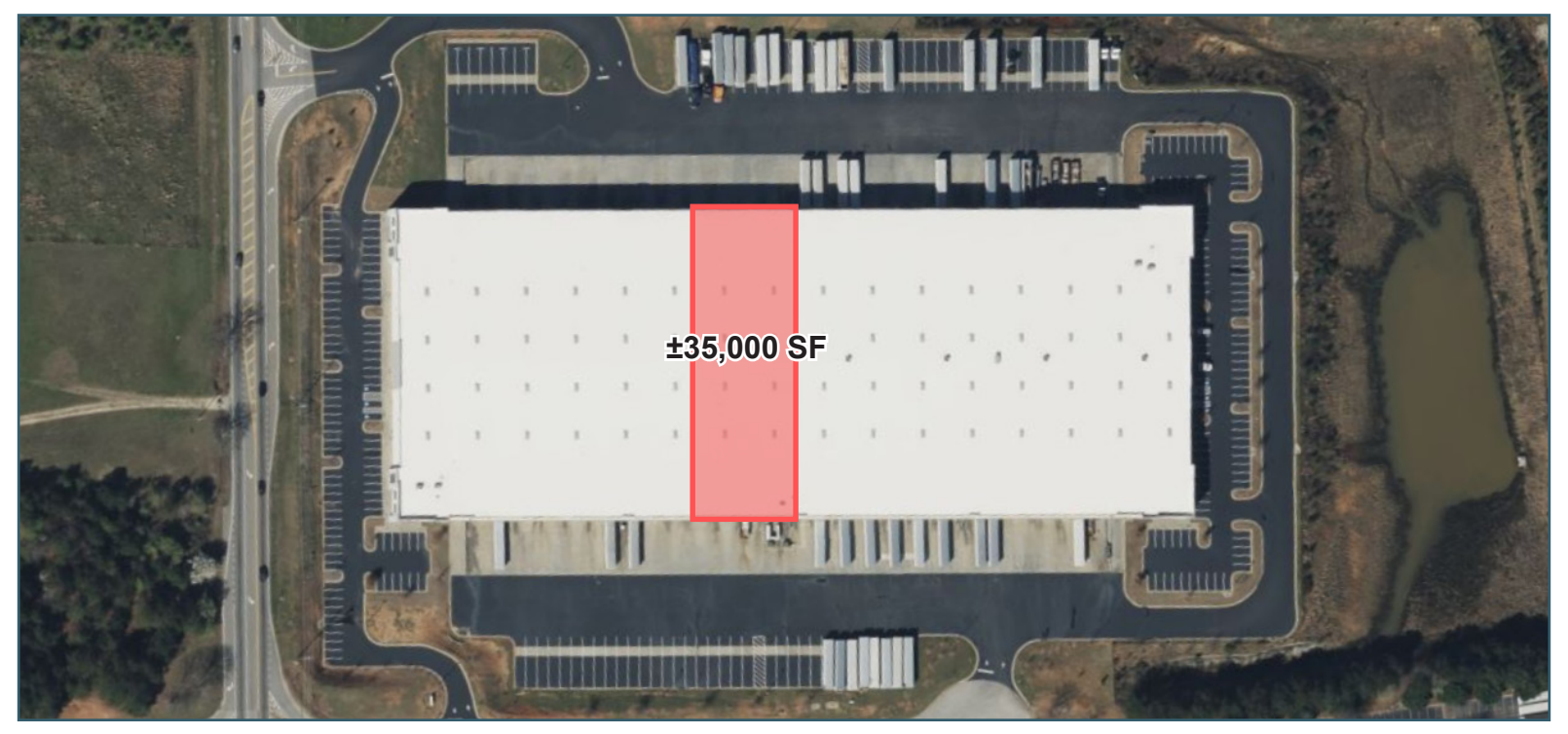
DEMISED OPTION 2 (ALTERNATE)