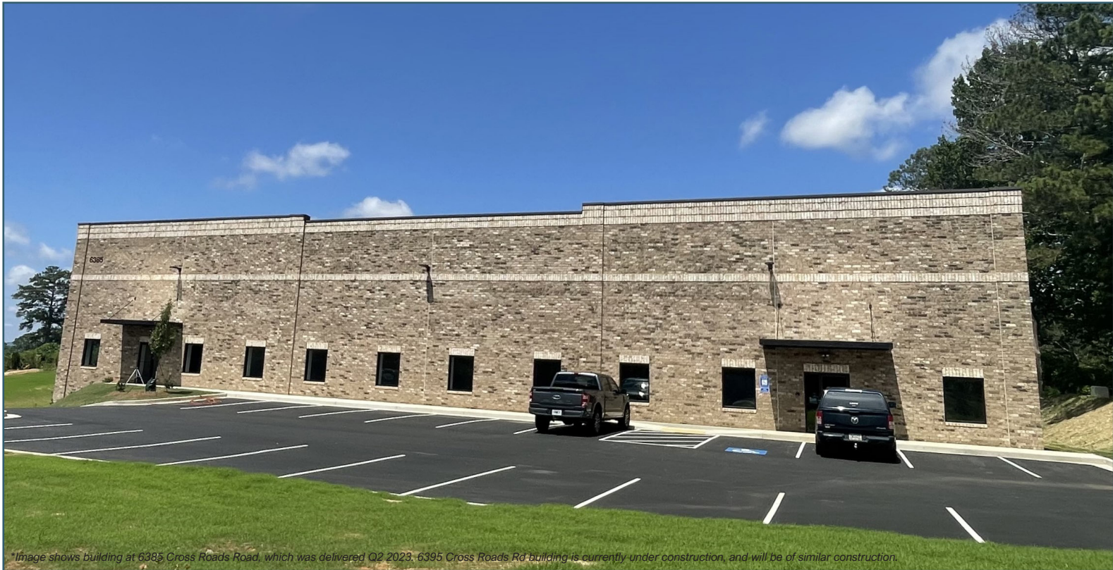
*Image shows building at 6385 Cross Roads Road, which was delivered Q2 2023. 6395 Cross Roads Rd building is currently under construction, and will be of similar construction.