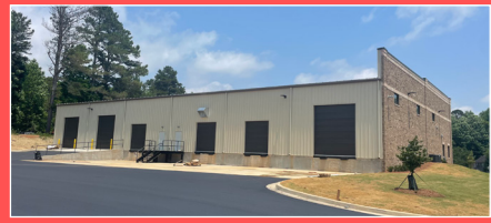
*Images show building at 6395 Cross Roads Road, which was delivered Q2 2023. 6395 Cross Roads Rd building is currently under construction, and will be of similar construction.